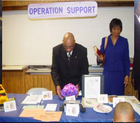
Operational Support Ministry