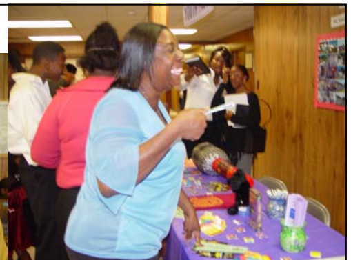
A member gathering information

On Sunday, March 6, 2005, Union Grove Missionary Baptist Church had a Ministry Fair. Many people came out to find out about the potential areas where they could serve. If you missed this event it is NOT TOO LATE. Contact any ministry leader for serving information. If you have other questions, contact your assigned deacon.