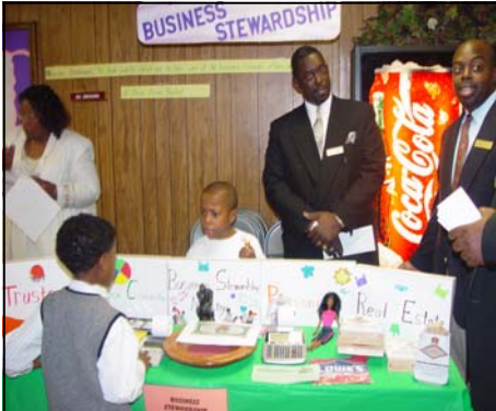
Business Stewardship Ministry