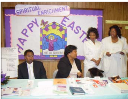
Spiritual Enrichment Ministry