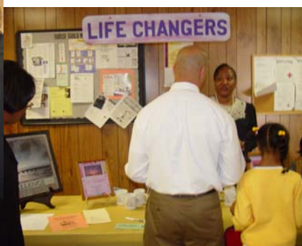
Life Changers: UGCEG