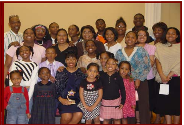
Youth Ministry Ministry Workers' Banquet, February 17th