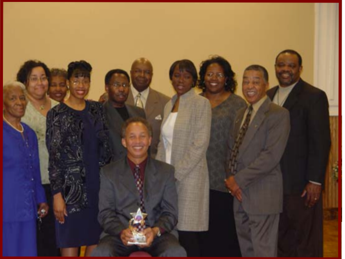
Spiritual Enrichment Ministry Ministry Workers' Banquet, February 17th