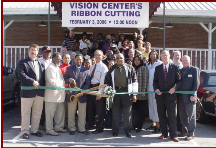
Vision Center Ribbon Cutting