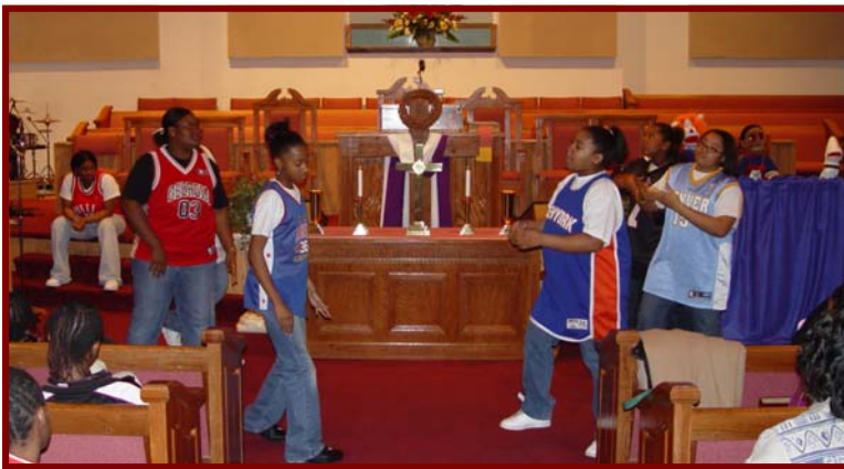
Genuine Praise Team February Youth Sunday