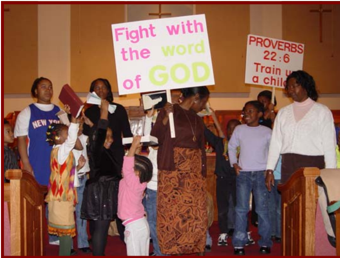
Nursery Ministry February Youth Sunday