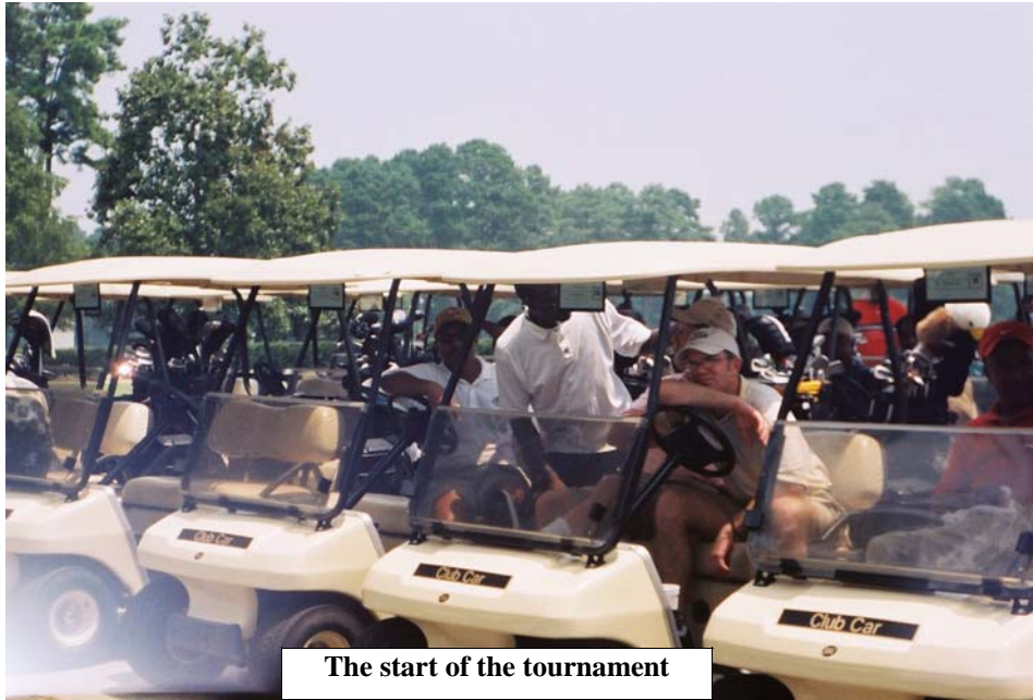
The start of the tournament