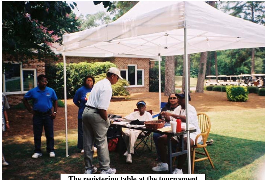
The registering table at the tournament

“I enjoyed seeing the people together and the fellowship. It was rewarding to have the golf tournament named after me; I was numb and elated. I enjoyed helping them out to make it work. If it had been named after anyone else I would have worked just as hard. Life Changers is a part of me. I love it and want it to flourish.